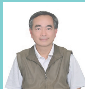
Professor Dept. of Chemical Engineering